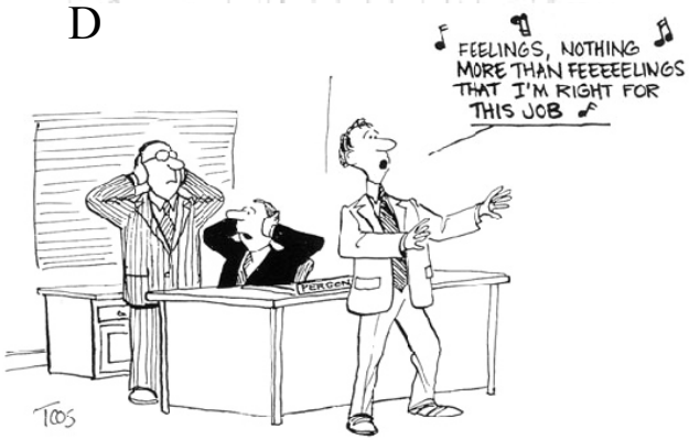
"He's threatened to continue singing until we hire him."